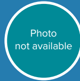
Photo not available