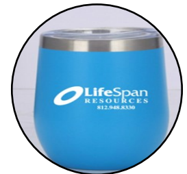
Stainless Wine Tumbler