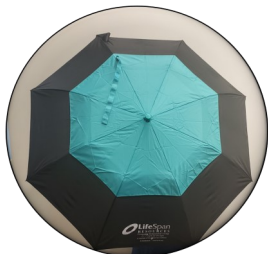
Teal Tote Umbrella