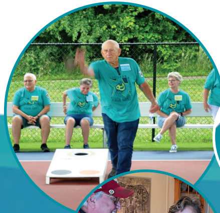
Senior Games Toss 'Em

110 individuals participated in Senior Games. 30 virtual Nursing Home Games participants. 70 Senior Games Gang Members. 50 Angel Tree Boxes delivered.