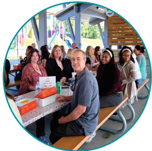
LifeSpan Resources' Case Managers enjoy a retreat. They care for over 3,000 clients a year!