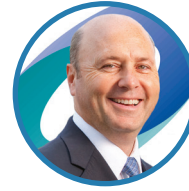
Mayor Jeff Gahan Floyd County