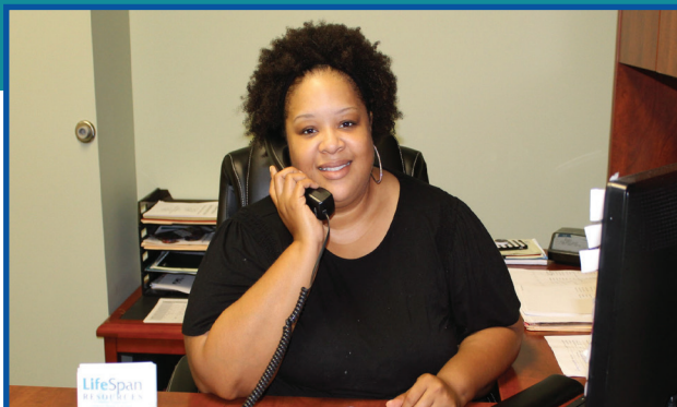
"How May We Help You?"

5,095 contacts were made through the ADRC. 882 of these were for Options Counseling via telephone or in person.