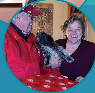
50 Senior Angel Tree boxes were filled with holiday goodies for our neediest clients.