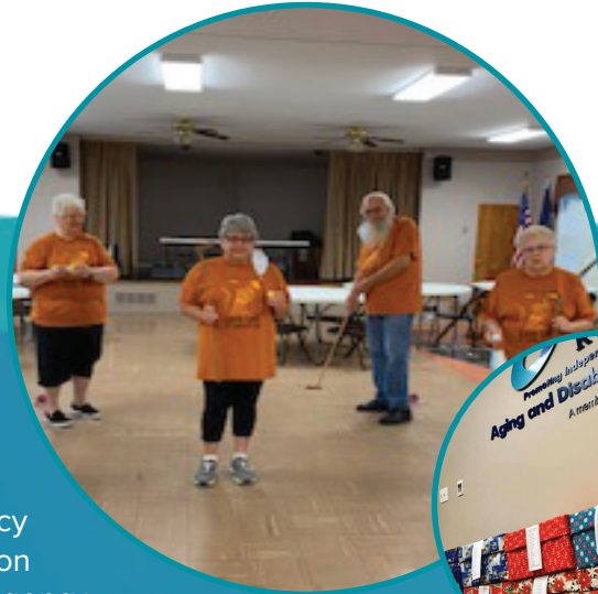
Senior Games At-Home Edition

110 individuals participated in Senior Games. 120 Senior Games Gang Members. 40 Angel Tree Boxes delivered to needy clients.