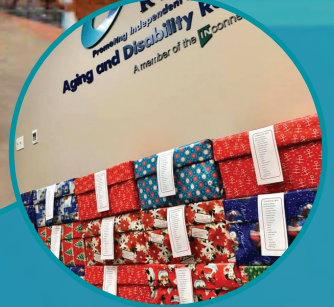
40 boxes were filled with goodies for our neediest clients.