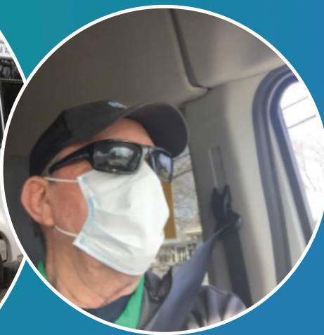
Masks and PPE were abundant during the pandemic.