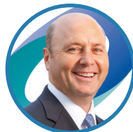
Mayor Jeff Gahan Floyd County