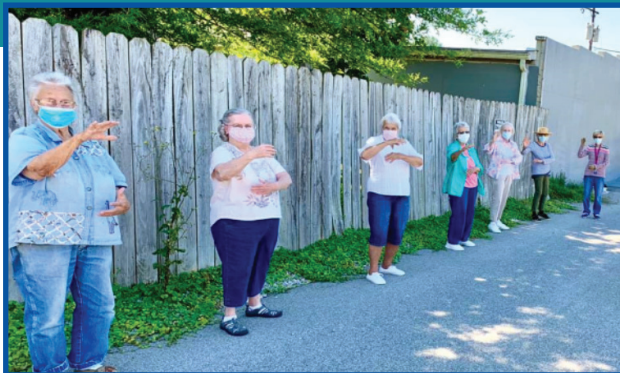
Joe Rhoads Senior Center, Alley Tai Chi

13,733 contacts (screenings, information or programs provided) were made in total through these programs, which includes 2,028 units of evidence-based wellness programming.