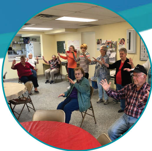
Tai Chi at Joe Rhoads Senior Center.